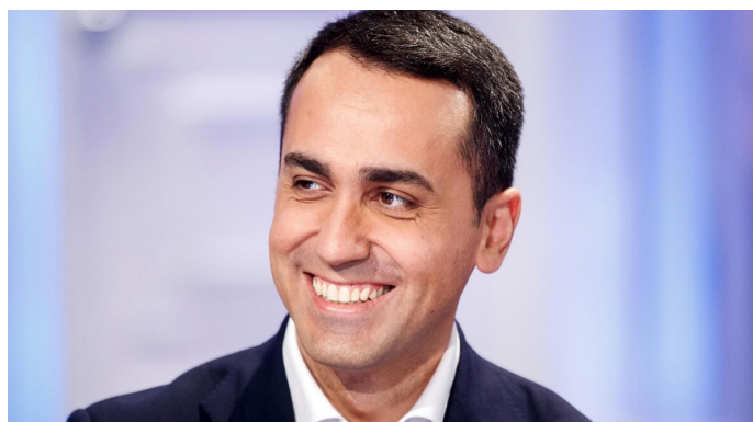
Luigi Di Maio

Although Di Maio is only 36 years old, he can look back on a political career spanning around a decade. In 2013 he was elected to parliament for the first time as a leading representative of the left-wing populist Five Star Movement. At the age of 26 he was elected the youngest Vice-President of the Chamber of Deputies in the history of the Italian Republic. From September 2017 to January 2020, Di Maio was party leader of the Five Stars. Under Di Maio's leadership, the protest movement founded by television comedian Beppe Grillo in 2009 achieved its greatest triumph in the March 2018 parliamentary elections head of government. In the left-wing government of the Conte II cabinet and in the broad coalition under Prime Minister Mario Draghi from February 2021 to October 2022, Di Maio then held the post of foreign minister. In June 2022, Di Maio left the Five Star Movement in a dispute with the new party leader Giuseppe Conte and tried to found